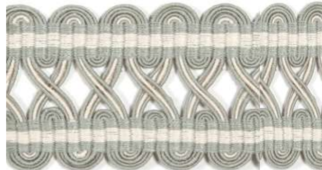
63mm Wide Gimp Braid WCP507 Col 4