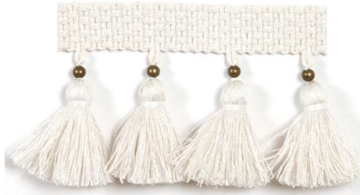
70mm Tassel Fringe WCP505 Col 2