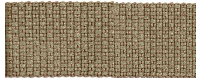
49mm Wide Braid WCP506 Col 5