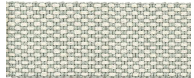
49mm Wide Braid WCP506 Col 4