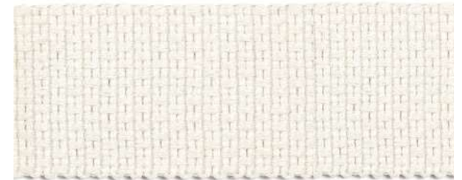
49mm Wide Braid WCP506 Col 2