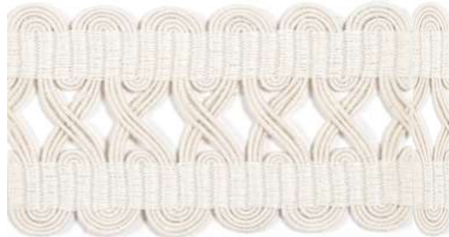
63mm Wide Gimp Braid WCP507 Col 2