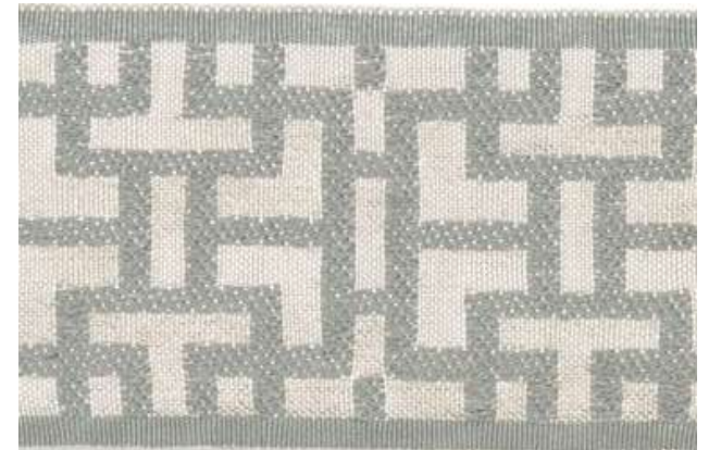
76mm Wide Border WCP508 Col 4