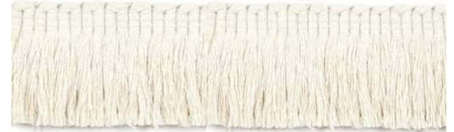
45mm Cut Ruche Fringe WCP 509 Col 2