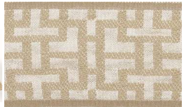
76mm Wide Border WCP508 Col 1