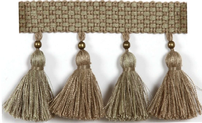
70mm Tassel Fringe WCP505 Col 5