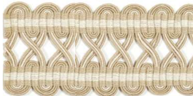
63mm Wide Gimp Braid WCP507 Col 1