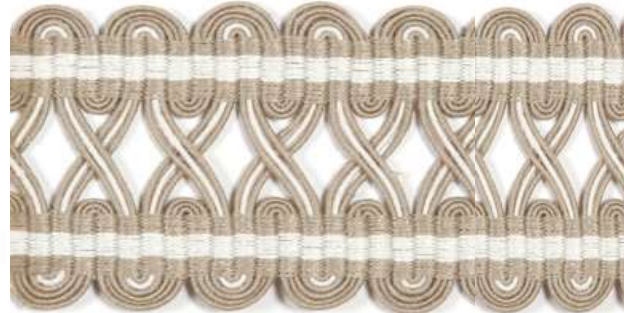
63mm Wide Gimp Braid WCP507 Col 3