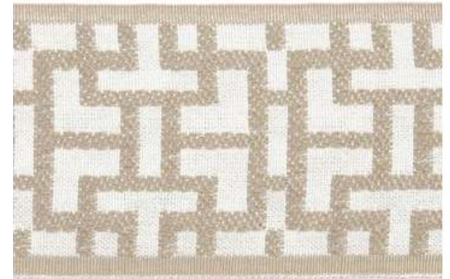
76mm Wide Border WCP508 Col 3