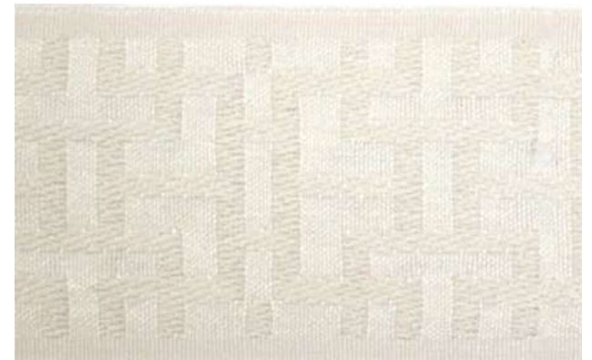
76mm Wide Border WCP508 Col 2