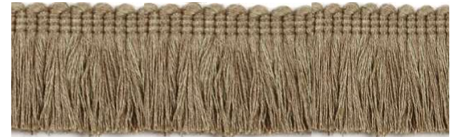
45mm Cut Ruche Fringe WCP 509 Col 5