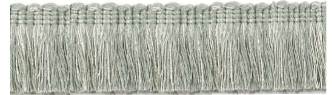
45mm Cut Ruche Fringe WCP 509 Col 4