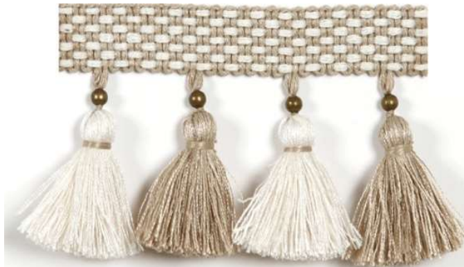
70mm Tassel Fringe WCP505 Col 3