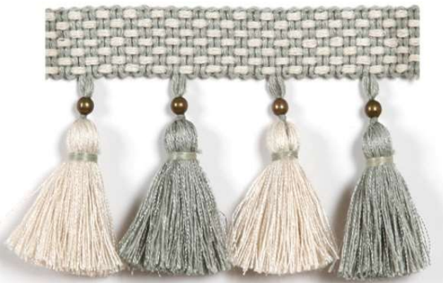
70mm Tassel Fringe WCP505 Col 4