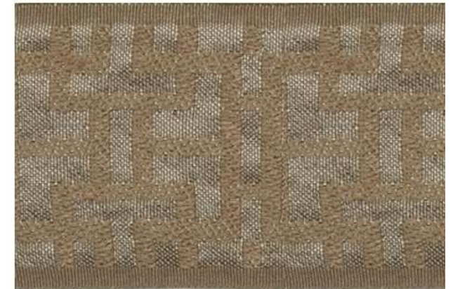
76mm Wide Border WCP508 Col 5