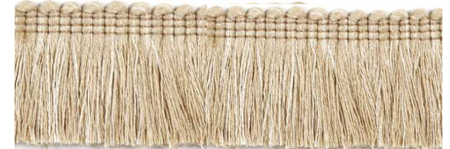
45mm Cut Ruche Fringe WCP 509 Col 1