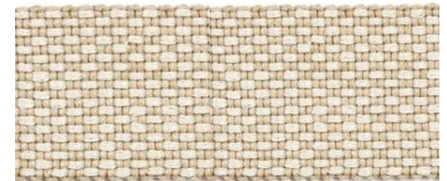
49mm Wide Braid WCP506 Col 1