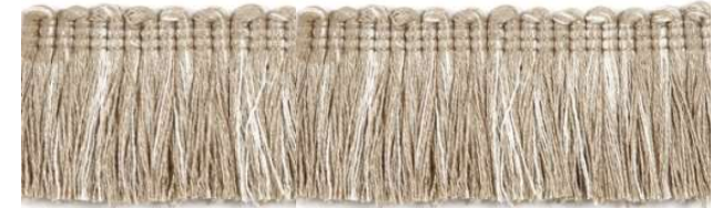
45mm Cut Ruche Fringe WCP 509 Col 3