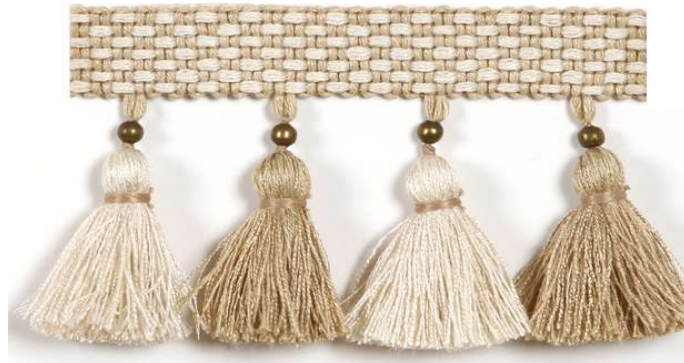
70mm Tassel Fringe WCP505 Col 1