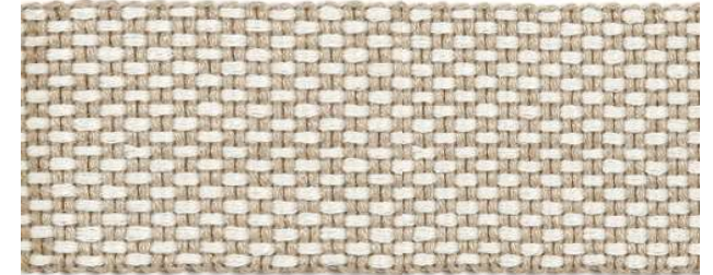
49mm Wide Braid WCP506 Col 3